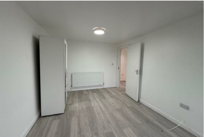
HOUSE - END TERRACE (EPC RATING: D)